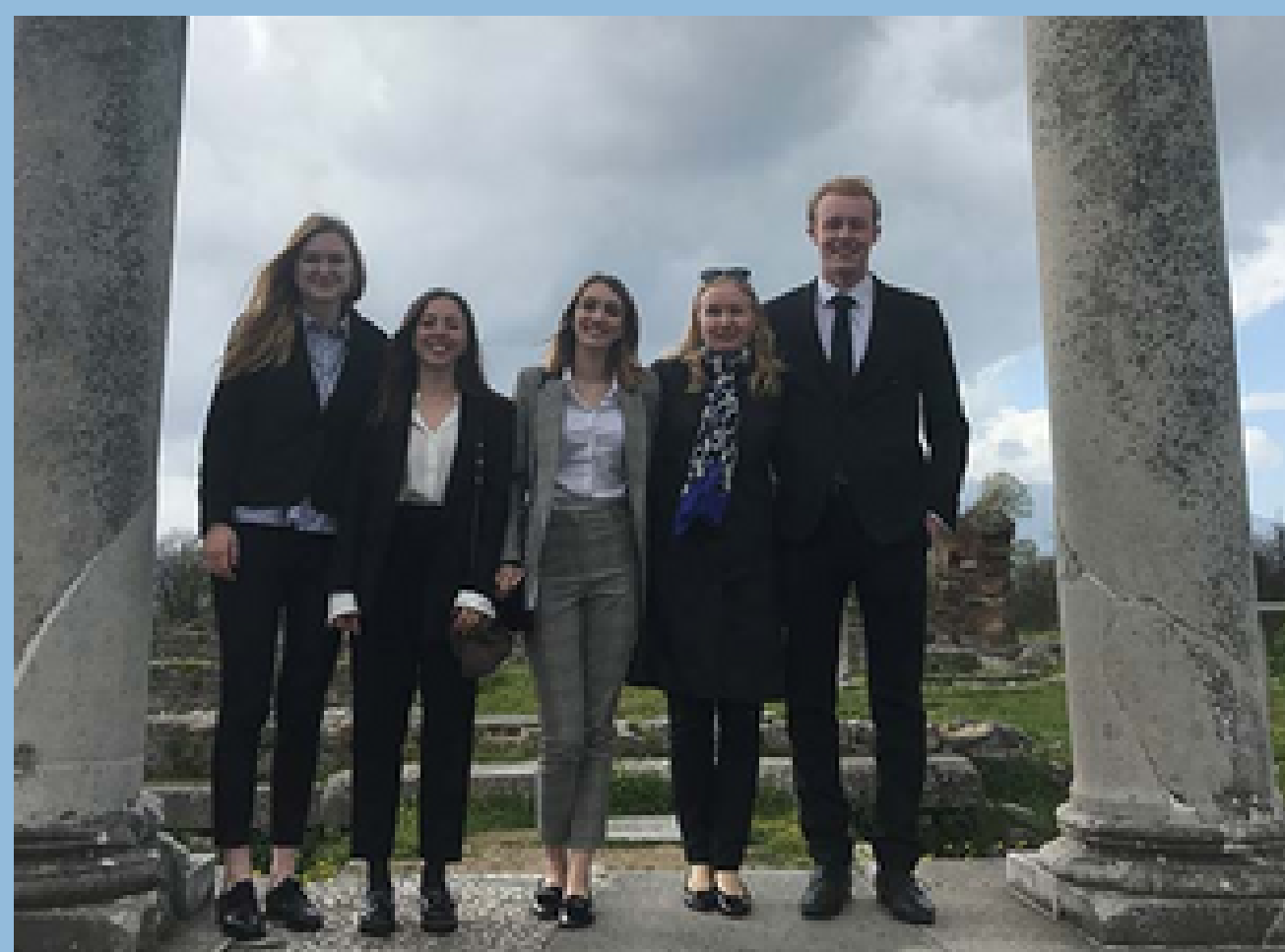
IEU Team 2018 2nd place