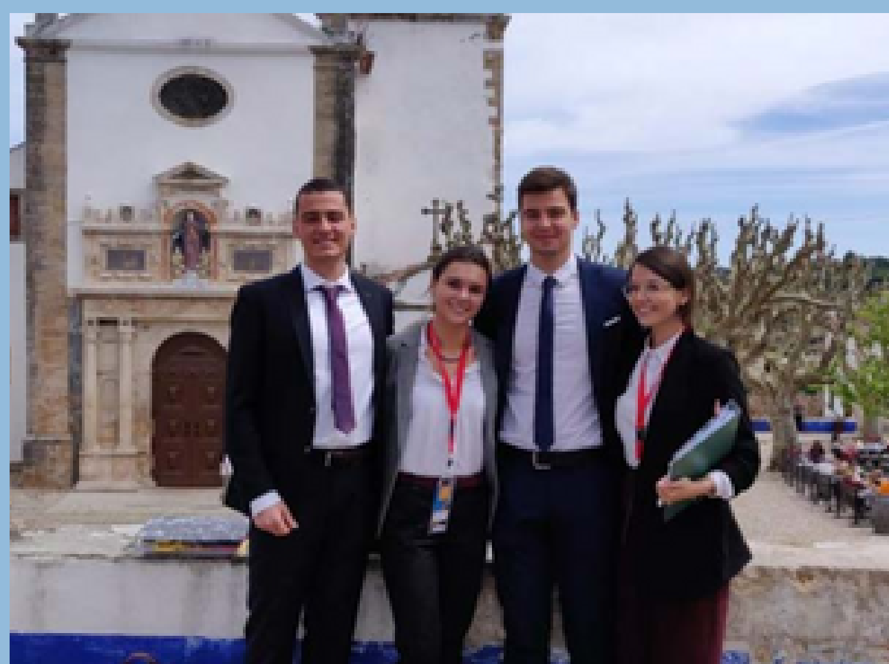
IEU Team 2019 WINNERS